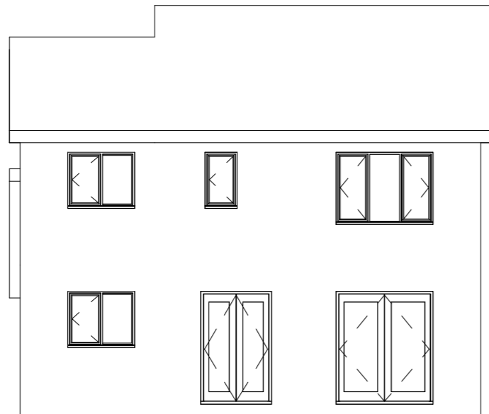
1 Existing north 1 : 100